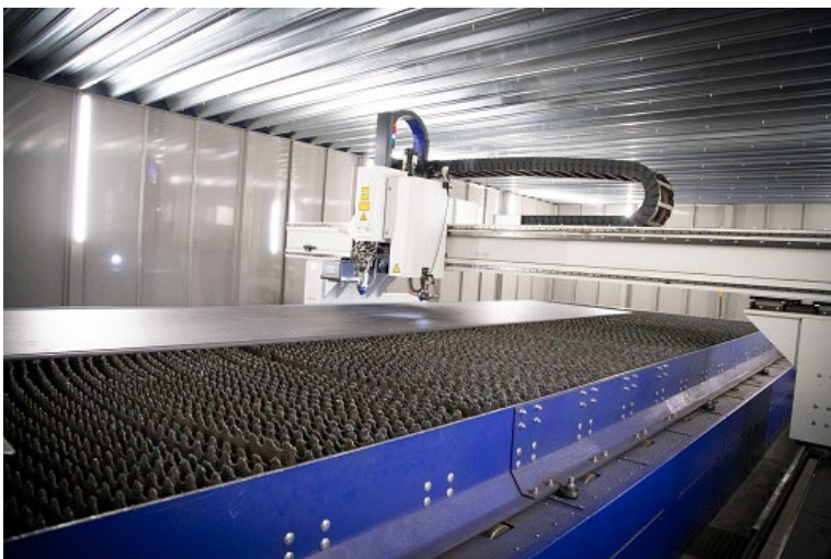
Image 2: The PowerBlade laser machine with 6kW bevel cutting head and OmniScript pin marker.