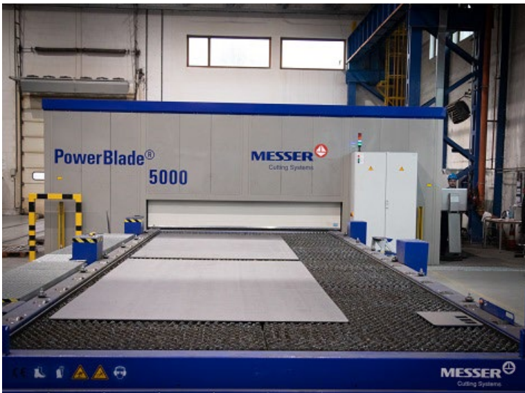
Image 1: The PowerBlade laser machine with housing in the new production hall in Tarnowskie Góry