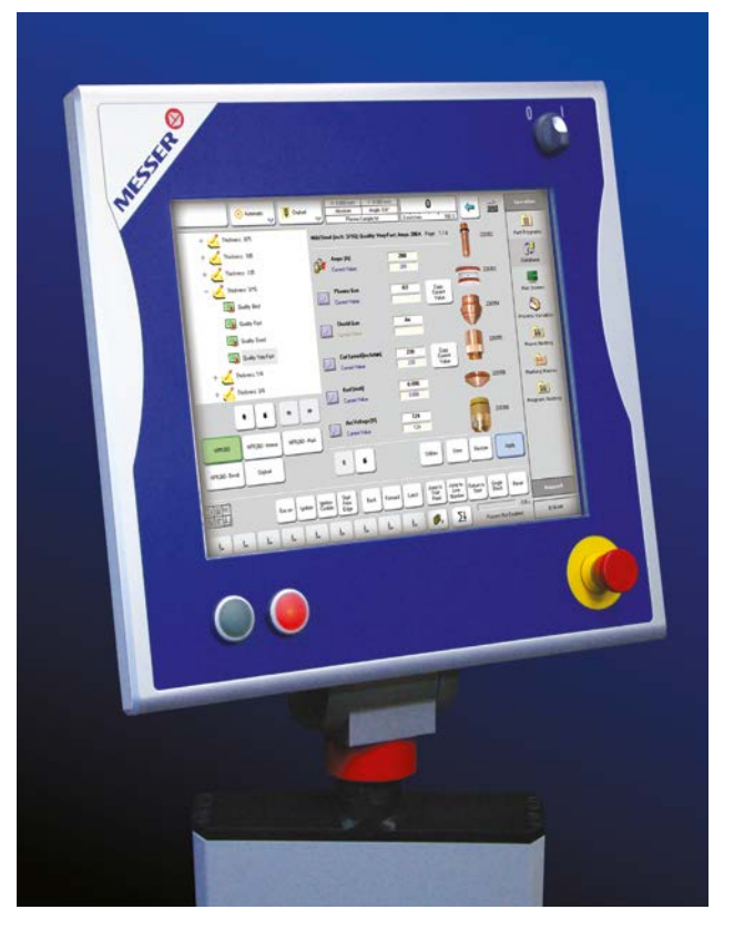
High strength machined aluminium enclosure